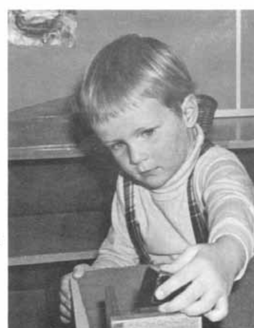
WENDY - CUBE OF BINOMIAL USED SENSORIALLY, AS A THREE DIMENSIONAL PUZZLE