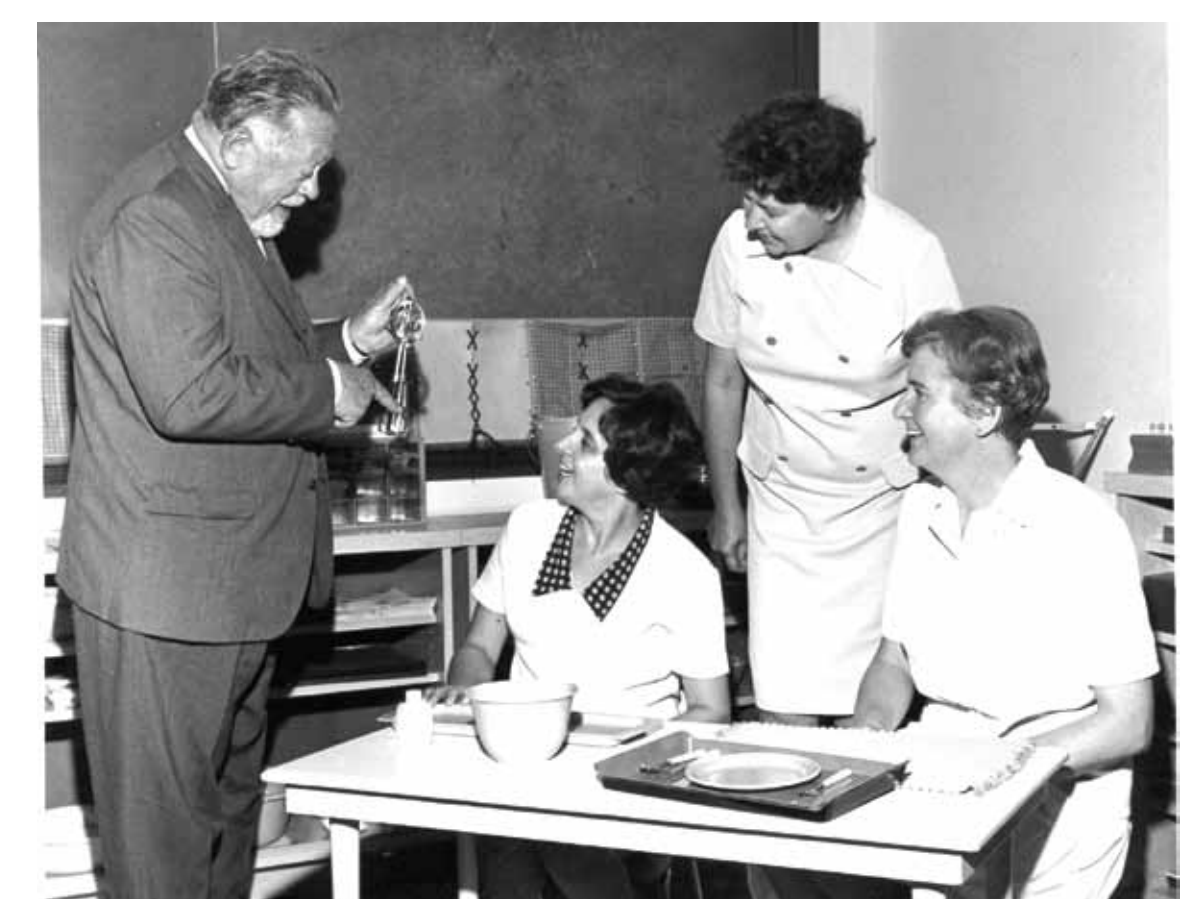
Mario Montessori Opens TMI