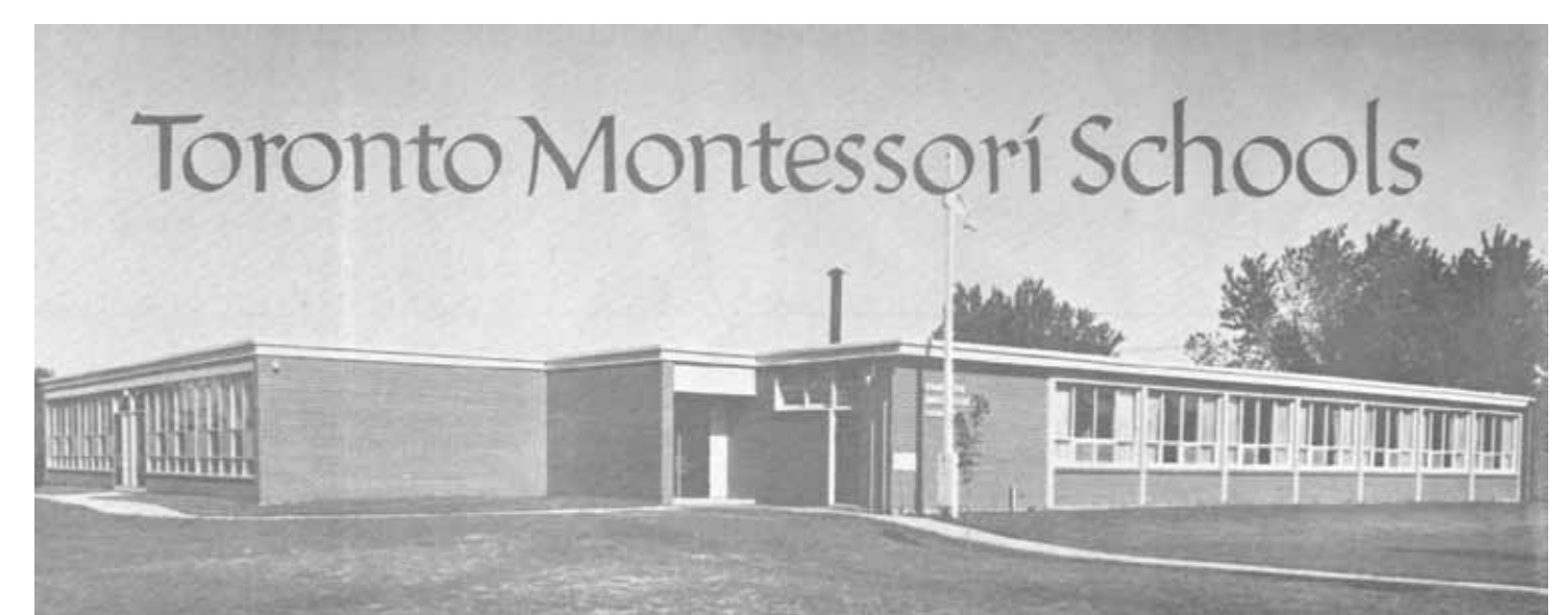
Toronto Montessori Schools - 1964